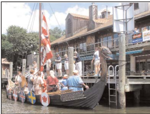
"Raiding" the Granary Restaurant