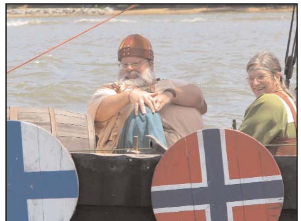
A Lost Viking hams it up while on the ship...