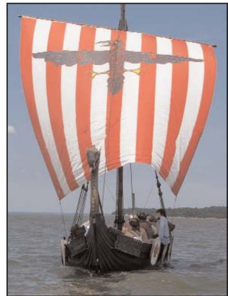
Enjoying the sail...