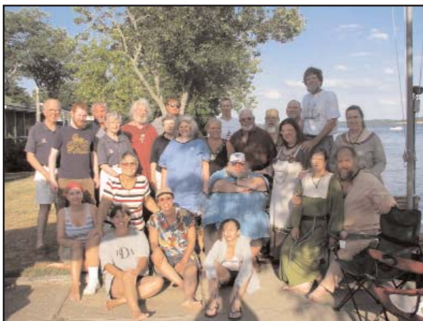
The whole gang - a bit sunburnt but happy

Being off the boat enabled me to get some great photos - as you will hopefully agree. The sail from Dave's house to Georgetown took a few hours, and the boat traffic was heavy, so we drew a lot of attention..