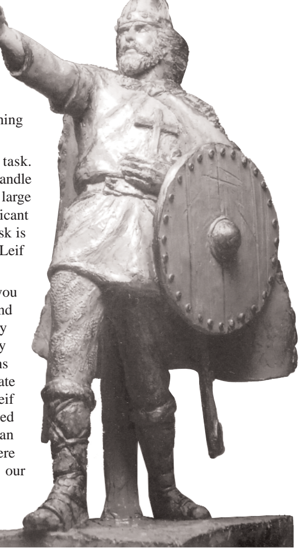
A model of the proposed Leif Ericson statue.

Too many people have been told only that Vikings were marauders and plunderers. Yes, they were aggressive in their efforts to